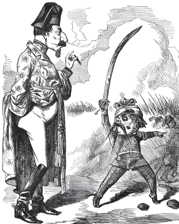
THE GIANT AND THE DWARF.

A cartoon published in Britain in June 1859. Napoleon III, on the left, is saying to Cavour, 'Bravo, my little fellow! You shall do all the fighting and we'll divide the glory.'